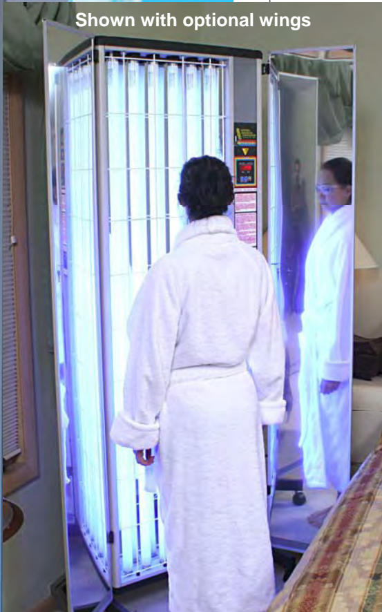
Shown with optional wings

Convenient, Effective, and Economical Phototherapy in the Comfort of Your Home